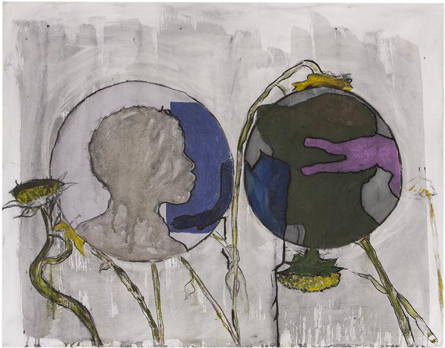
When The Moon Visits 2020

Acrylic, Drawing Ink and Charcoal on Canvas 78 x 100 cm