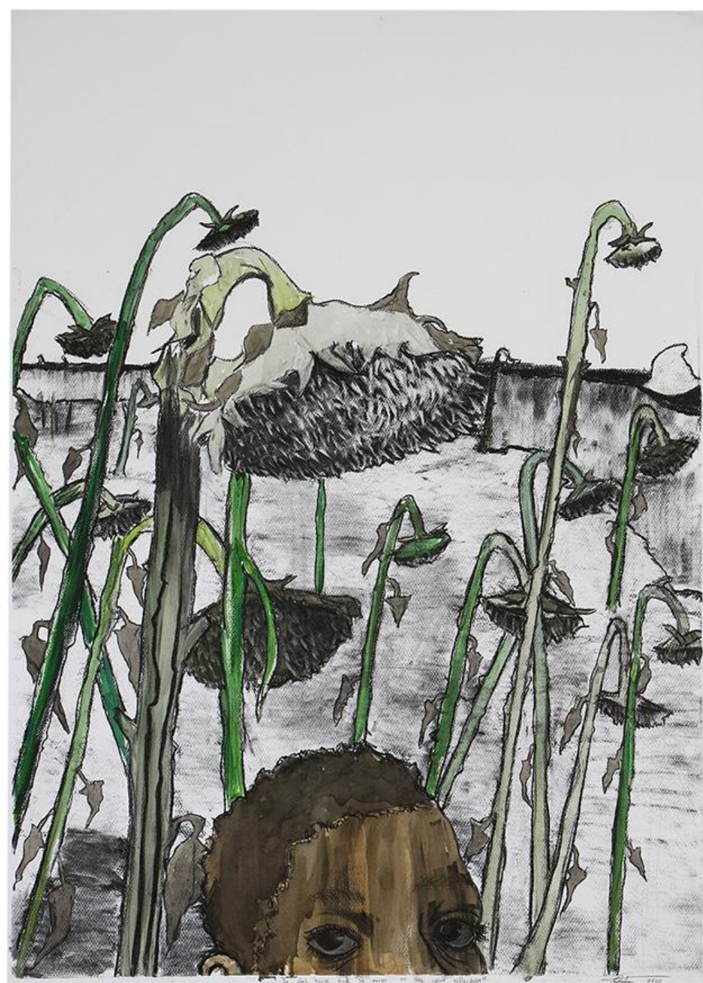
The Glass House Made It Easier To See Your Reflection