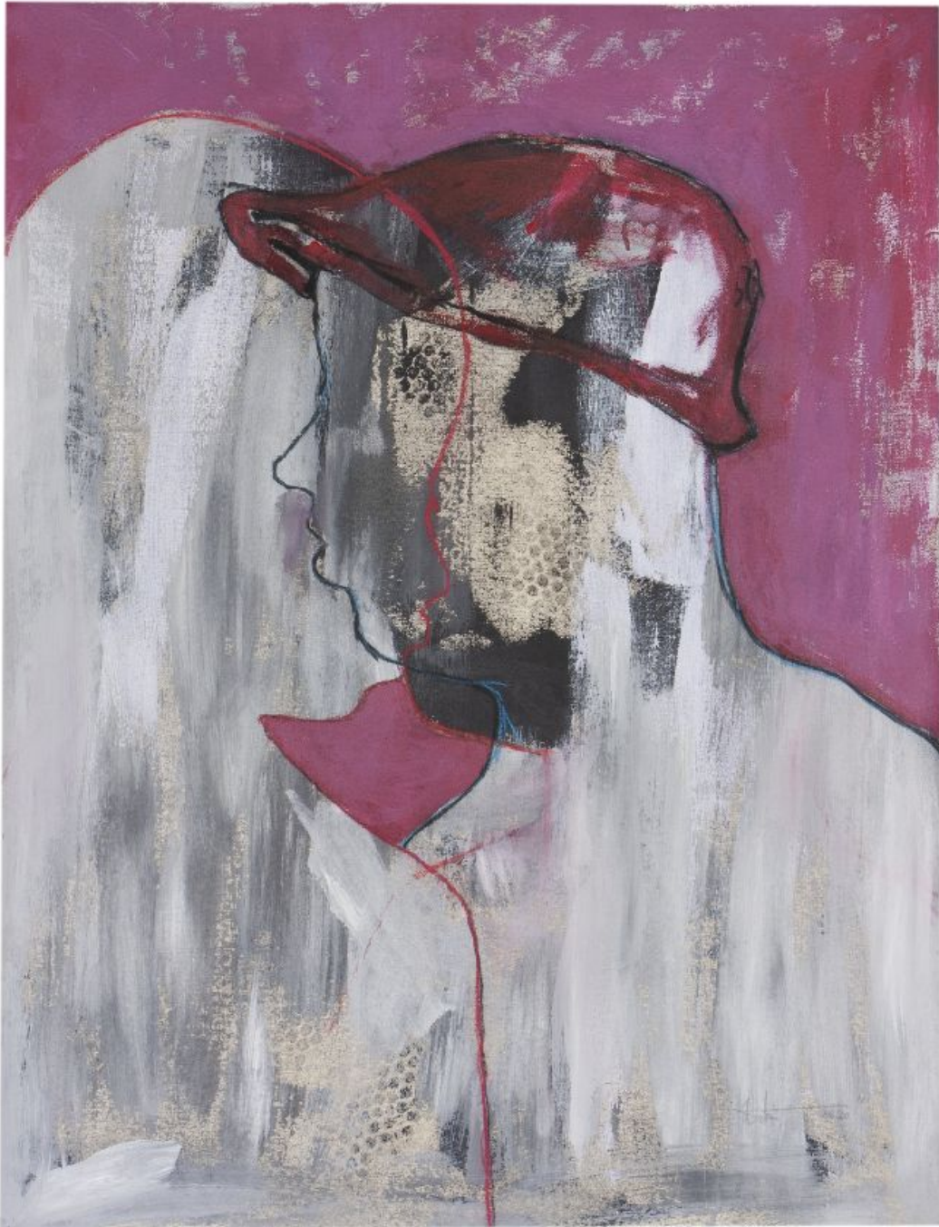
Assume That I Am Listening 2020

Acrylic, charcoal and soft pastel on canvas 99 x 78 cm