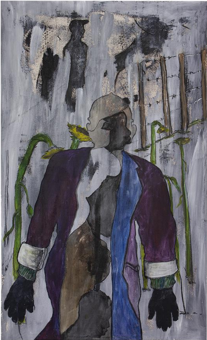
The Shadow Waits To Talk To You When The Sun Kisses Your Complexion