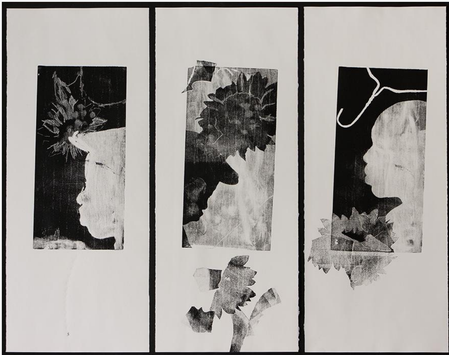
Should I Clean The Mirror? 2020 Monotype on Fabriano paper 55,8 x 72 cm