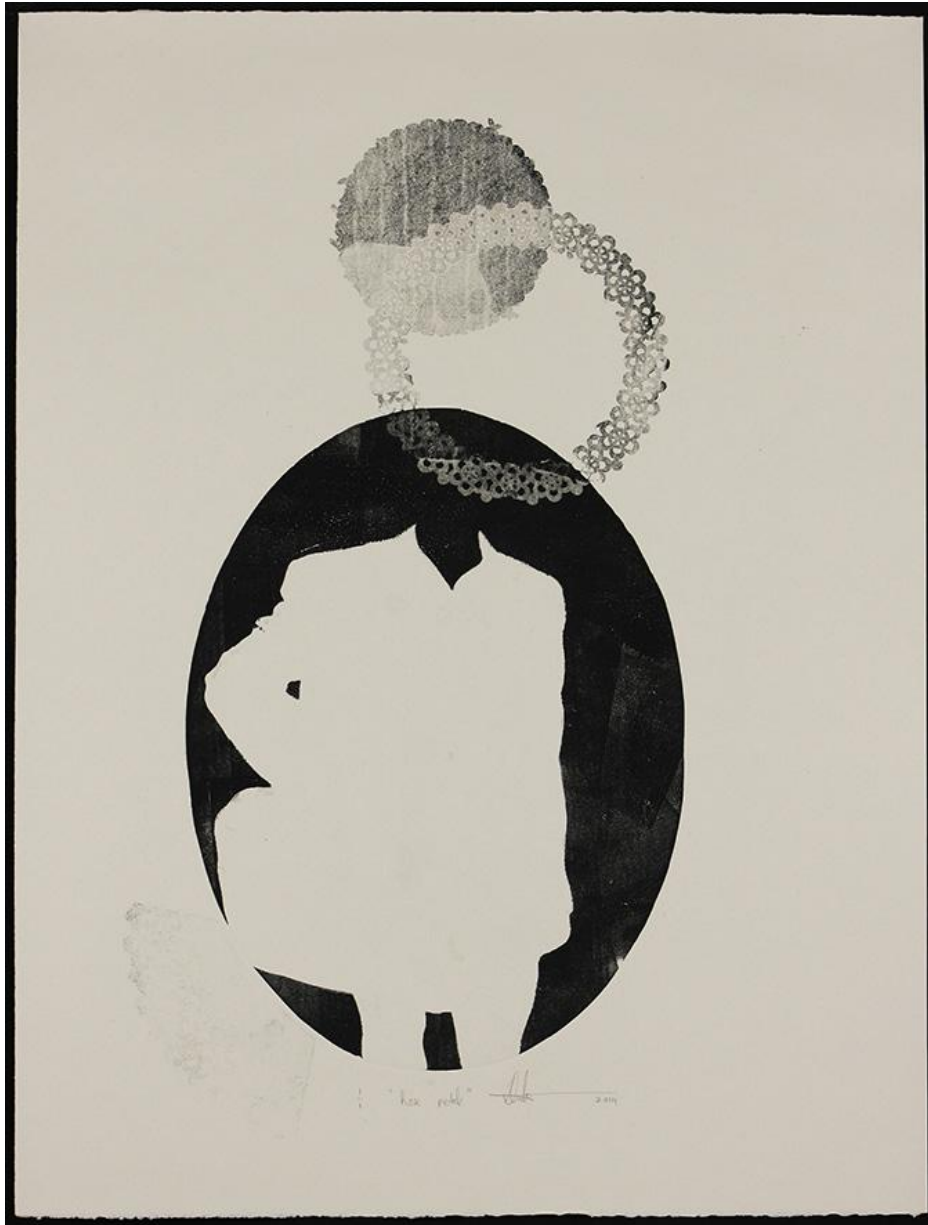
Rose Petal , 2019 Monotype on Fabriano paper Edition 1/1 65 x 50 cm R8,500.00 (framed)