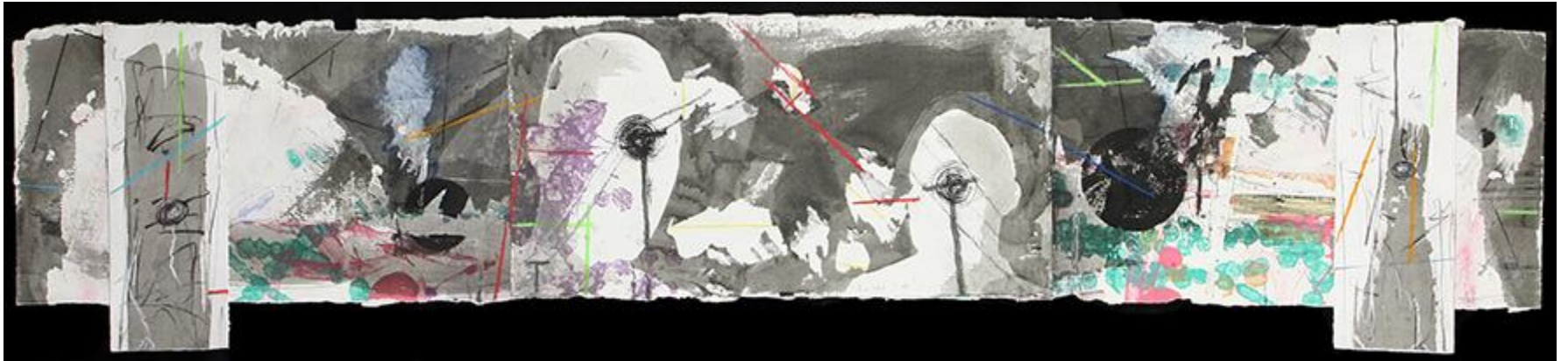
Pixilated Light , 2019 Mixed Media on Handmade Paper 35 x 164 cm R 9,000 Unframed