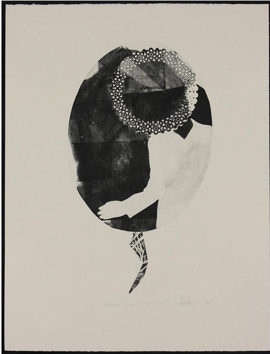
Eternity Seems Promising, 2019 Monotype and Lino on Fabriano Edition 1/1 65 x 50 cm R8,500.00 (framed)