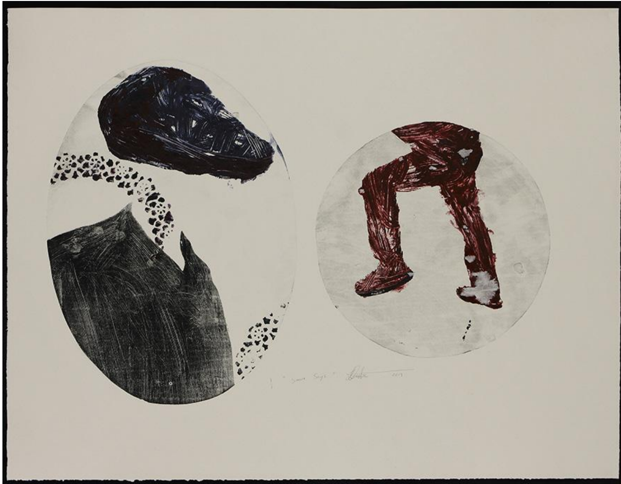
Simon Says , 2019 Monotype, Tissue Paper on Fabriano Edition 1/1 50 x 65 cm R8,500.00 (framed)