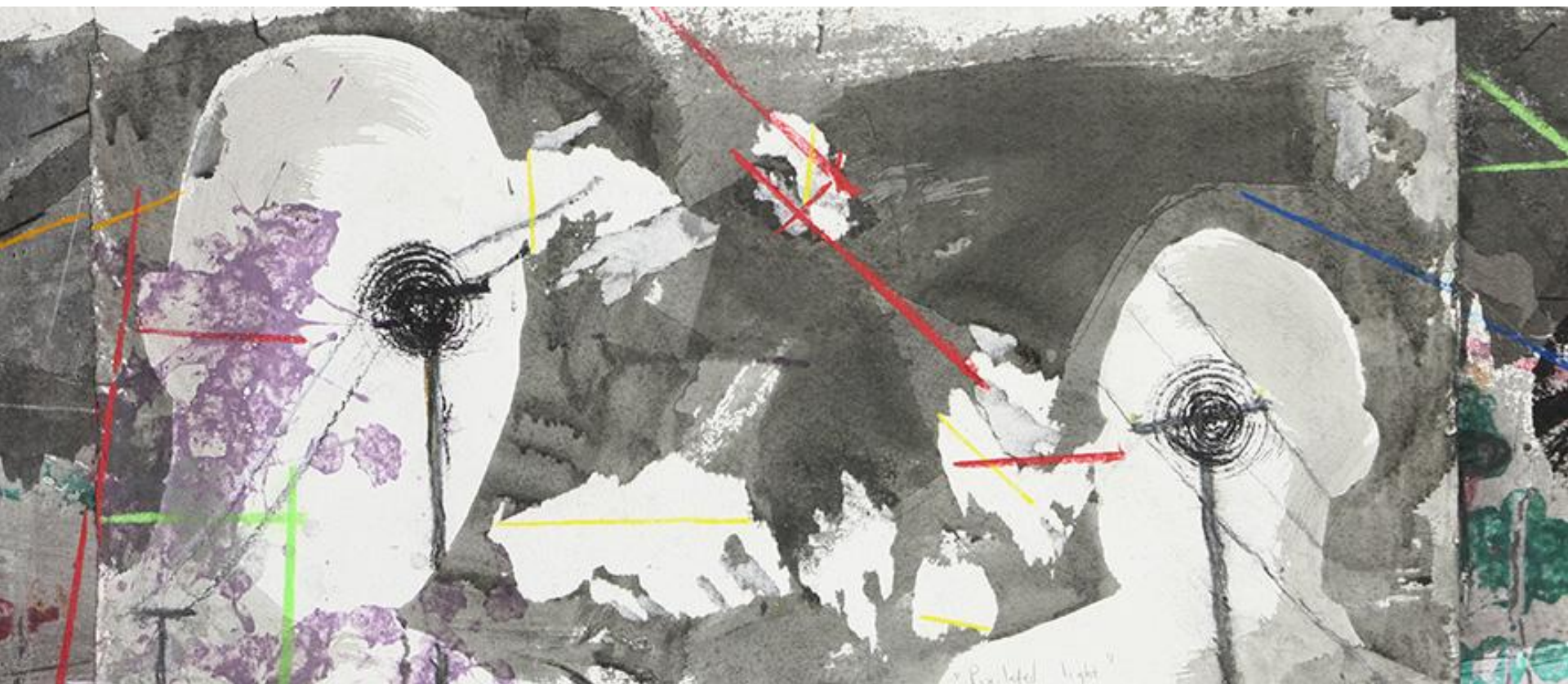
Pixilated Light , 2019 Detail