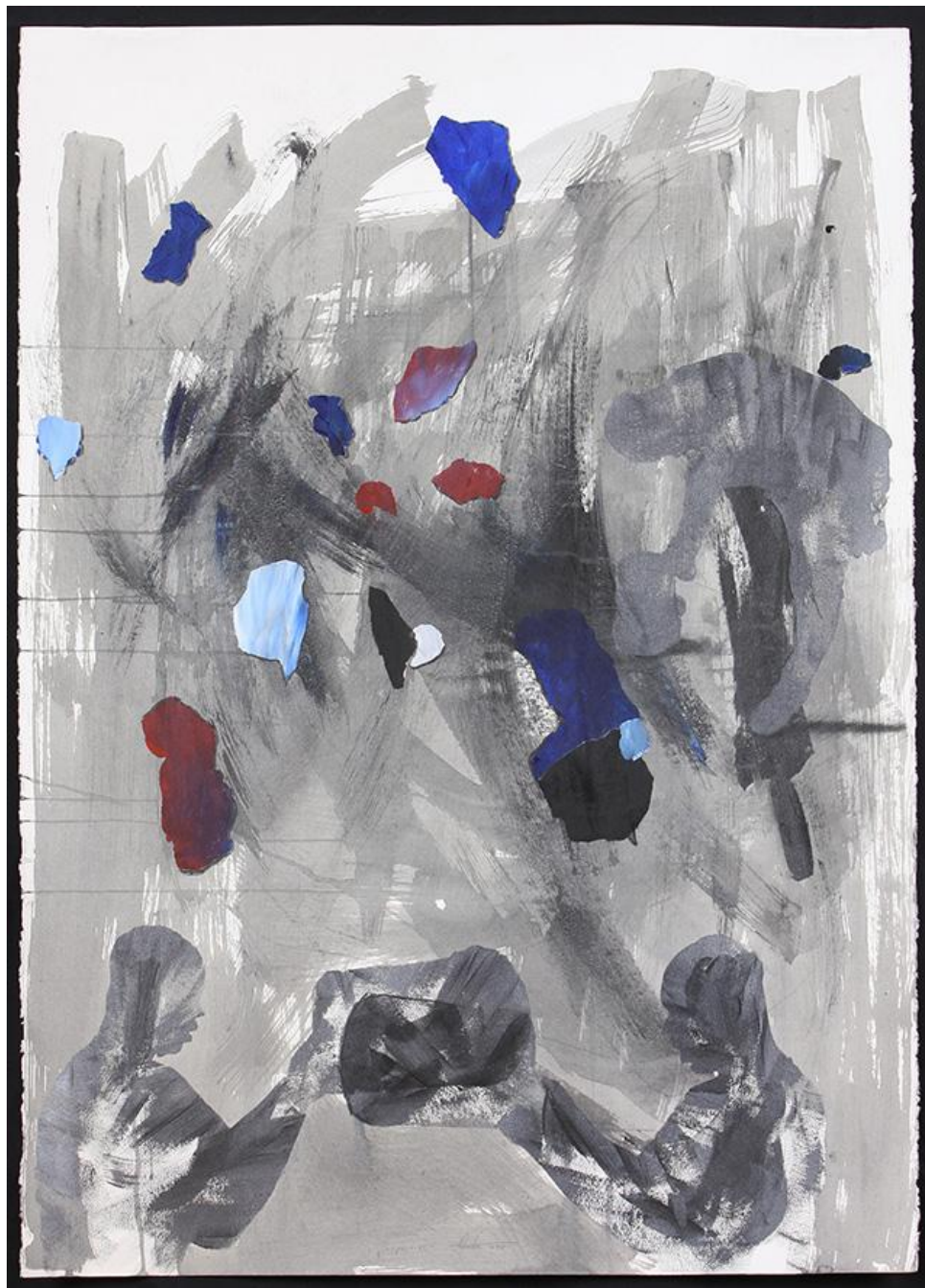
Perspective , 2019 Acrylic, Drawing Ink and Charcoal on Fabriano 100 x 70 cm R11,000.00 (unframed)